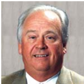
James R. Andrews, MD